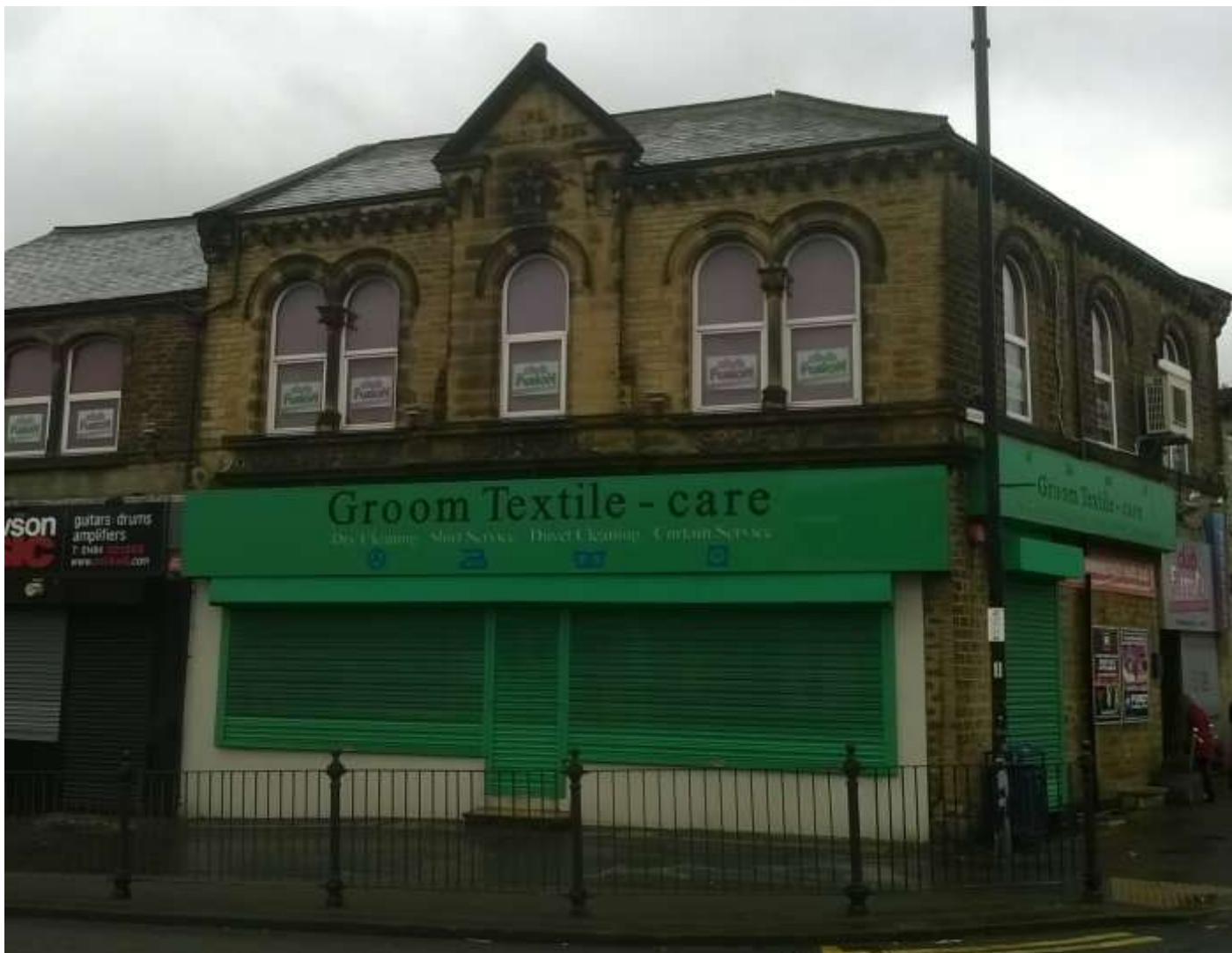
The original Marsh Co-op.

Holy Trinity should be proud to be the final resting place of this forgotten hero and I hope that the restoration of the gravestone this year will lead to a growing partnership with the co-op in the years to come.