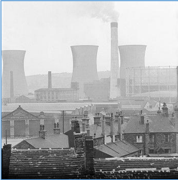
Huddersfield Power Station and Gasworks 1960s

was hoped that the clock-face could be illuminated but it was considered too expensive and the request to the Huddersfield Corporation for a contribution towards the cost was turned down. It only took us 135 years to light up the clock, re-using one of the lights from inside church!